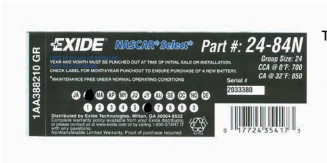
The Dater confirms purchase of February 2006

In this example, an Exide NASCAR Select 84 Month 24-84N battery with a Suggested Retail Price of $130.99 was in service for 36 months. It was purchased February 2006 and returned February 2009.